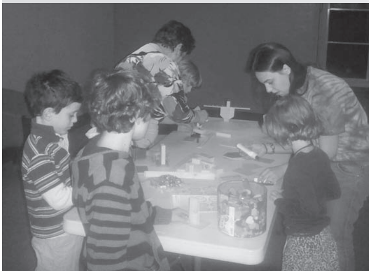
Pre-K and Kindergarten students and teachers making Hanukkiyot at the SSRS Hanukkah Celebration