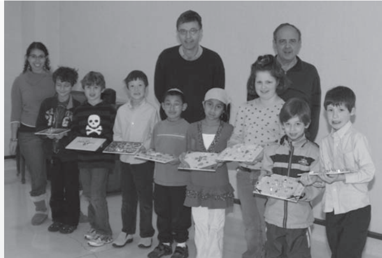
Bet class with Hannukiyot