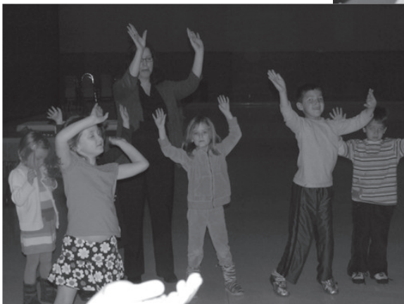
Pre-K to 2 nd graders dancing during "Hanukkah Around the World."