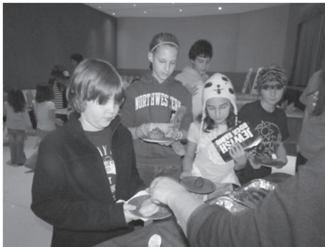
6 th graders enjoying latkes and sufganiyot!